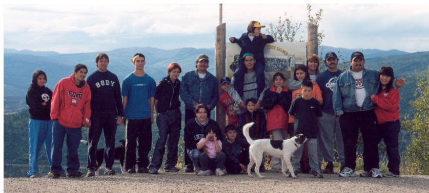
Youth Group on Field Trip to Dawson

New School – The new school planning group is being assembled by the Minister of Education's office as required by the Intergovernmental Agreement signed between YTG and LSCFN. Village Council is deeply concerned about the scope of the agreement, our limited representation, and the potential impact on Village revenues should the site of the new school be located off YTG lands. The Mayor and CAO* met with Minister Edzerza on Nov. 21, discussed concerns, and are optimistic that these will be favorably addressed in the planning cycle.